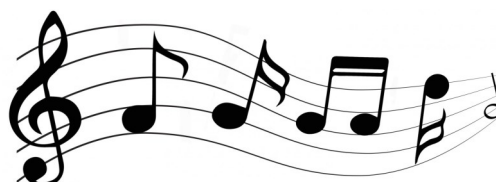
Music and Drama