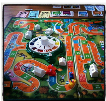
Beat the board