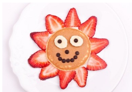
Fun with Food!